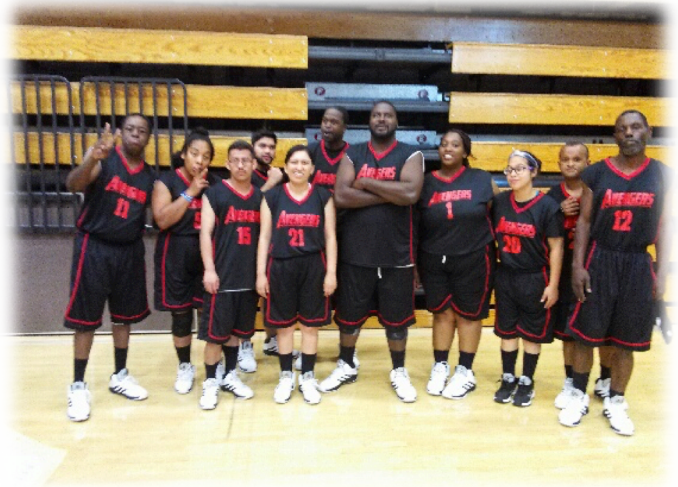
the sclarc avengers