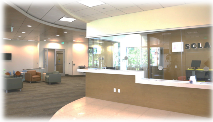
reception area in the Legacy Building

13,500 stakeholders with a budget of $150 million dollars. SCLARC began an exhaustive search in the early 2000's for their new headquarters that would meet their operational and programmatic needs. This was particularly difficult within the agency's low-income service area, where few large office facilities exist. The organization decided to take action by devising a financing and development plan with its Board of Directors to build a permanent headquarters.