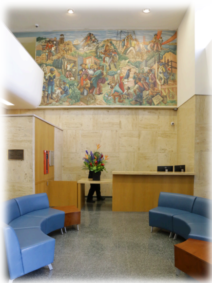
reception area in the golden state mutual building

Other invaluable partners behind this project included Primstor Development, one of the most experienced, minority-owned developers in Los Angeles; AE3 Partners, the lead architectural firm; Steinberg Architects, a firm specializing in historic projects and KSJ Construction, a newly-formed, minority general construction company. Together, the aforementioned entities were able to realize SCLARC's vision for its new headquarters.